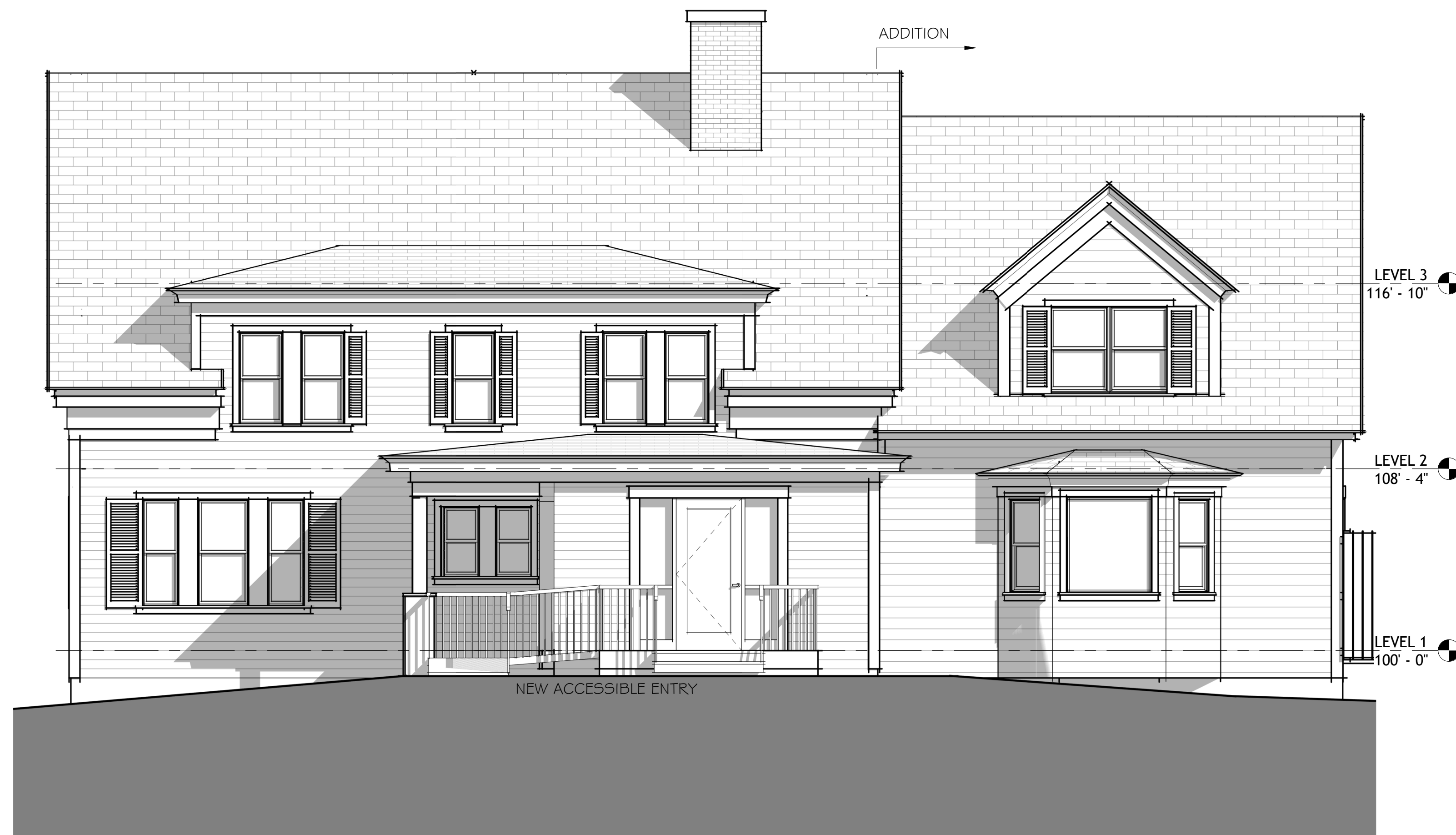
3 WEST ELEVATION 1/4" = 1'-0"