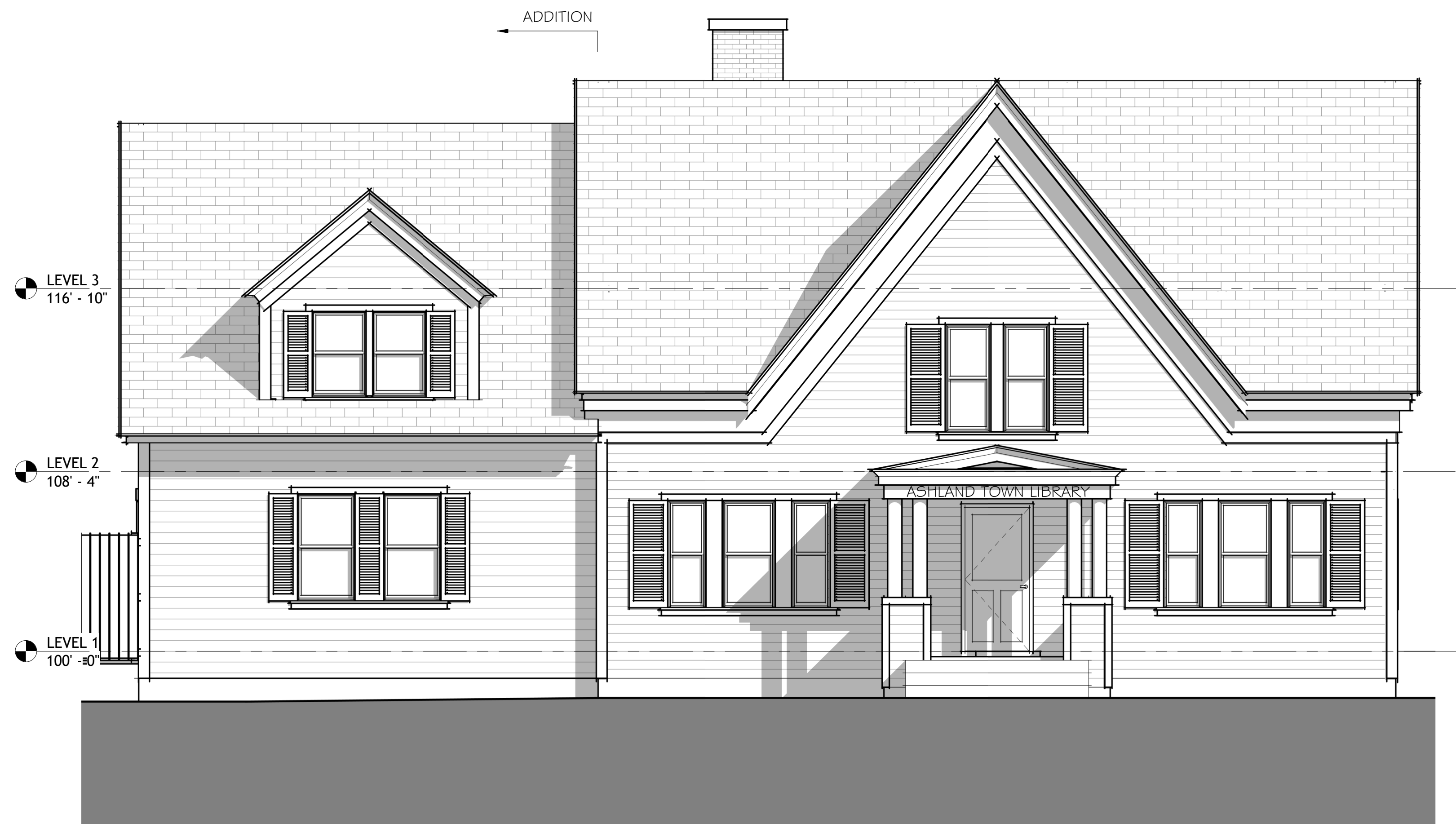
1 EAST ELEVATION 1/4" = 1'-0"