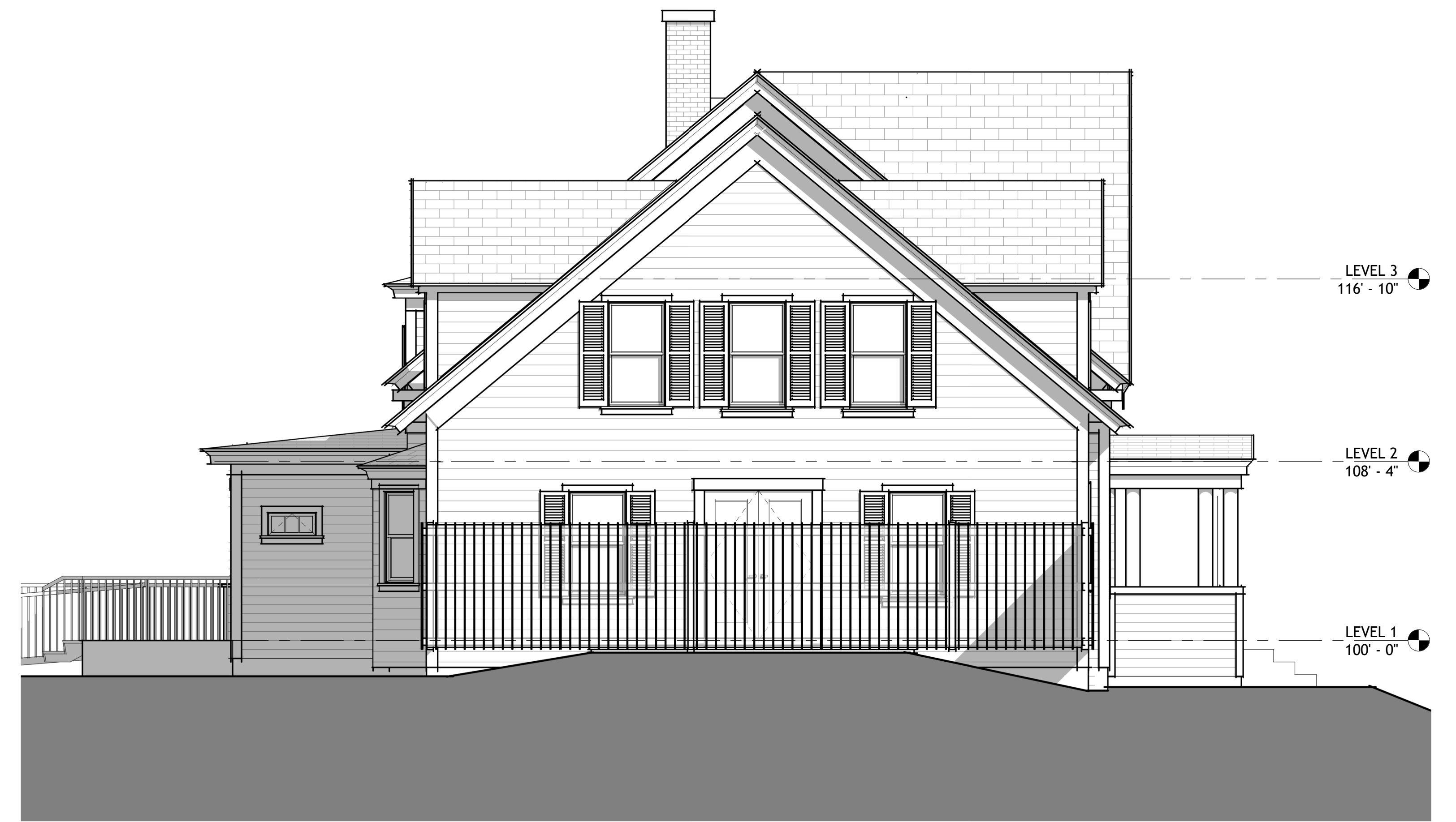
4 SOUTH ELEVATION 1/4" = 1'-0"