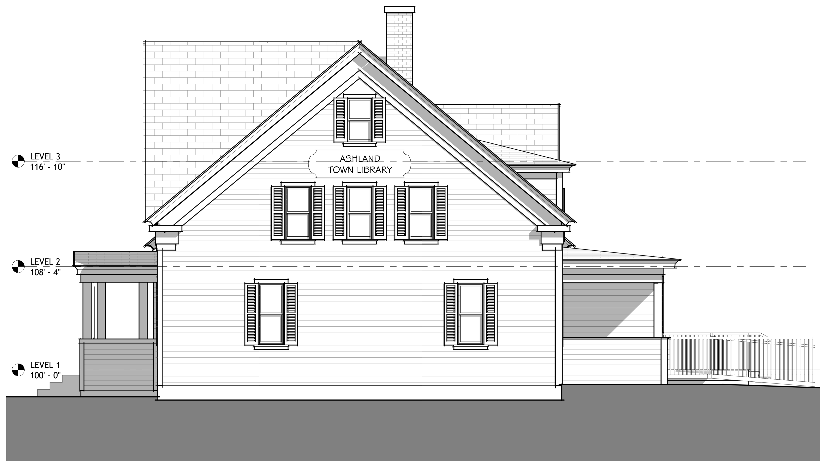
2 NORTH ELEVATION 1/4" = 1'-0"